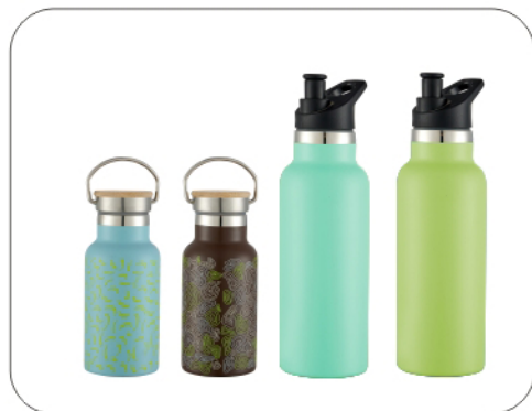
Model Capacity Packing LH-6065 350/500/750/1000ml 24PCS/CTN