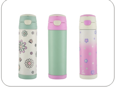
Model Capacity Packing LH-6151 500ml 24PCS/CTN