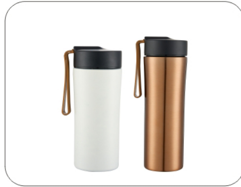
Model Capacity Packing LH-6061 350ml/500ml 24PCS/CTN