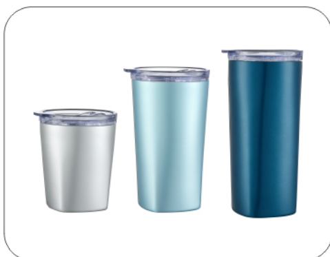
Model Capacity Packing LH-6125 300ml/470ml/650ml 24PCS/CTN