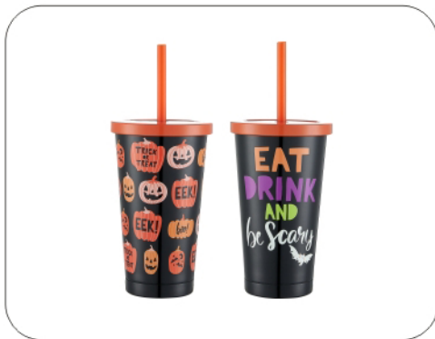
Model Capacity Packing LH-6030 590ml 24PCS/CTN