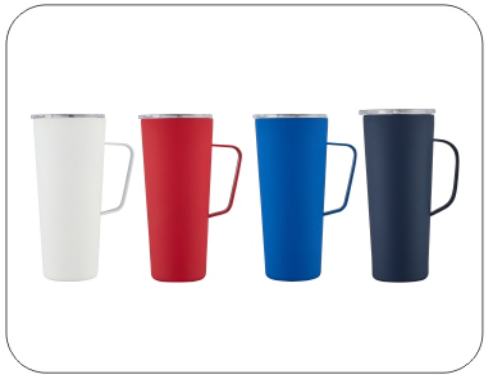
Model Capacity Packing LH-6155 600ml 24PCS/CTN