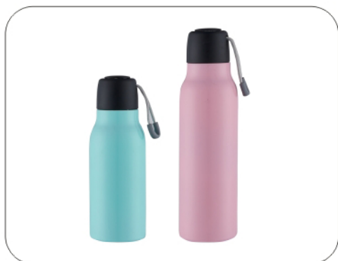
Model Capacity Packing LH-6611 350ml/500ml 24PCS/CTN