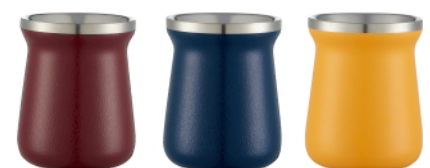
Model Capacity Packing LH-6605 290ml 24PCS/CTN