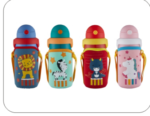
Model Capacity Packing LH-6043 600ml 24PCS/CTN