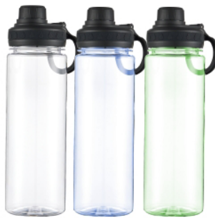
Model Capacity Packing LH-SL-1 750ml 24PCS/CTN