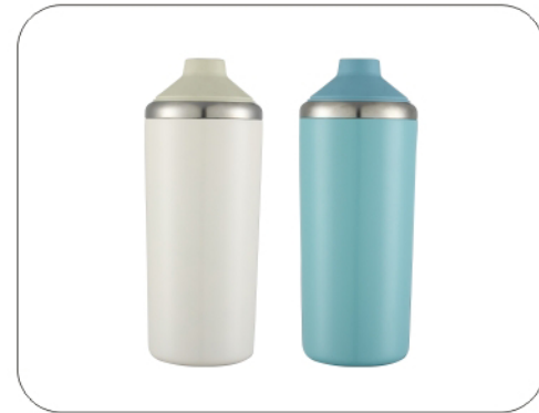
Model Capacity Packing LH-6109 1000ml 24PCS/CTN