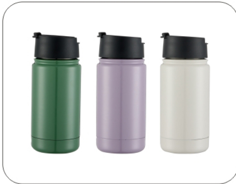
Model Capacity Packing LH-6001 350ml 24PCS/CTN