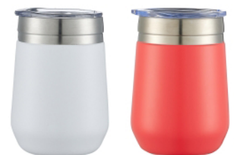
Model Capacity Packing LH-6604 350ml 24PCS/CTN