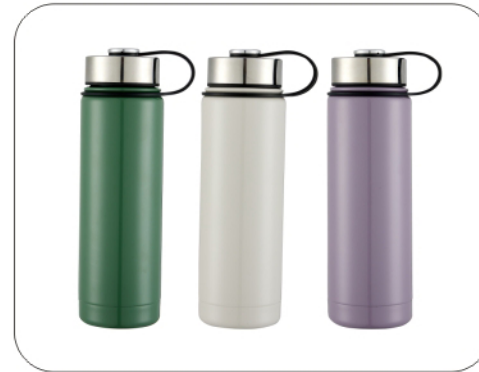
Model Capacity Packing LH-6001 600ml 24PCS/CTN