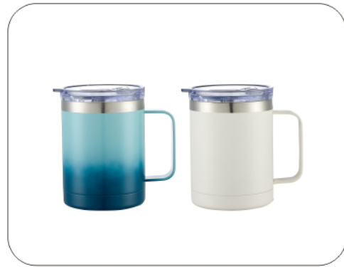
Model Capacity Packing LH-6168 380ml 24PCS/CTN