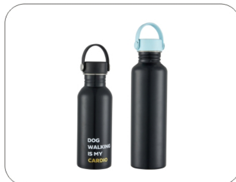
Model Capacity Packing LH-6055 500ml/750ml 24PCS/CTN