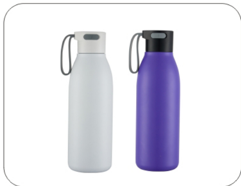
Model Capacity Packing LH-6212 540ml 24PCS/CTN