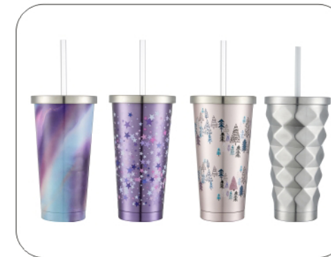
Model Capacity Packing LH-6030 700ml 24PCS/CTN