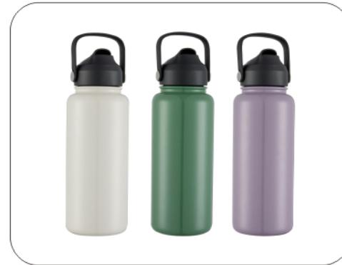
Model Capacity Packing LH-6093 1000ml 24PCS/CTN