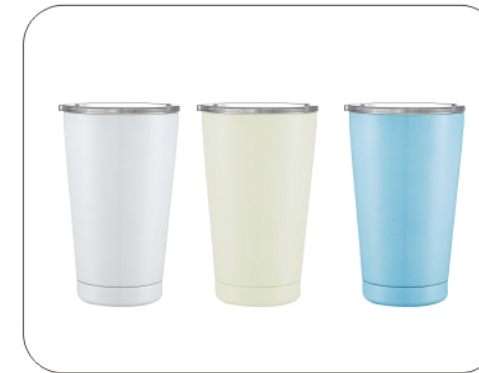
Model Capacity Packing LH-6098 470ml 24PCS/CTN