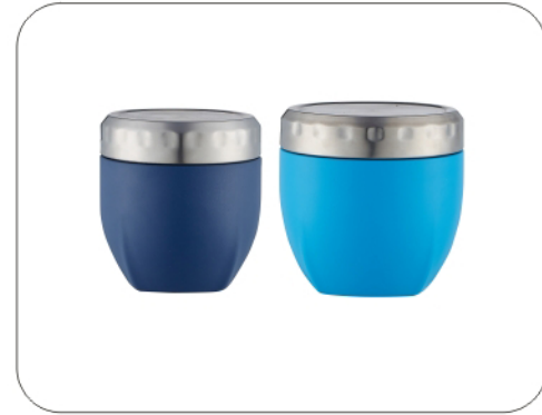
Model Capacity Packing LH-6135 450ml/650ml 24PCS/CTN