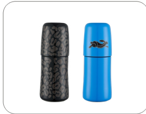
Model Capacity Packing LH-6205 280ml 24PCS/CTN