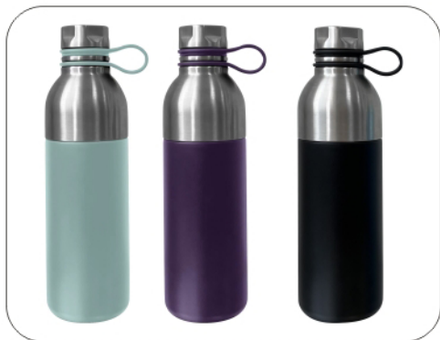
Model Capacity Packing LH-6609 700ml 24PCS/CTN