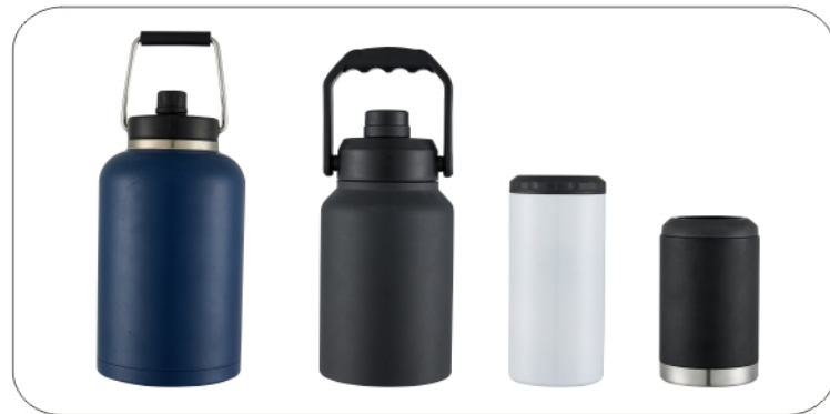
Model LH-6801 LH-6802 LH-6193B LH-6193 Capacity 1900ml 950ml 470ml 350ml