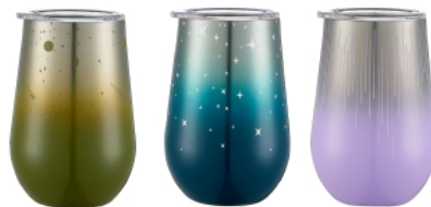
Model Capacity Packing LH-6041 350ml 24PCS/CTN