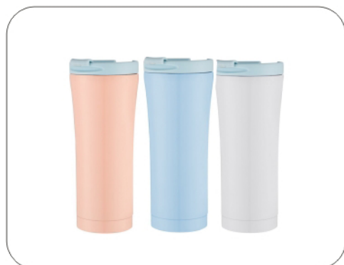
Model Capacity Packing LH-6010 500ml 24PCS/CTN