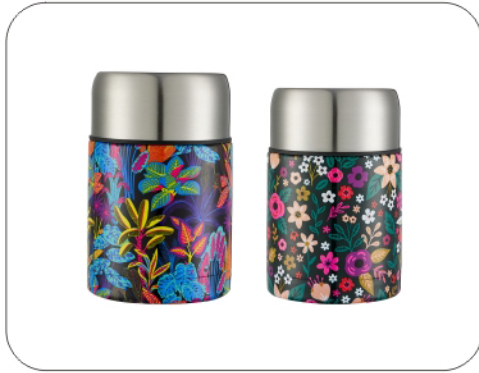
Model Capacity Packing LH-6201 800ml 24PCS/CTN