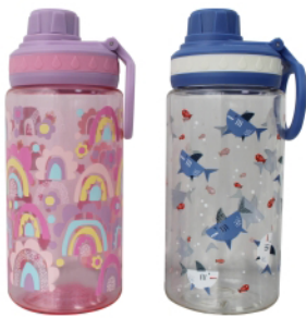
Model Capacity Packing LH-SL-4 560ml 24PCS/CTN