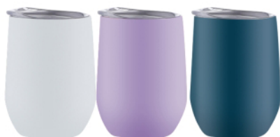
Model Capacity Packing LH-6152 350ml 24PCS/CTN