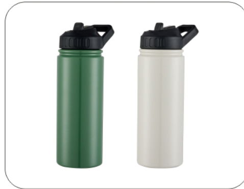
Model Capacity Packing LH-6093 500ml 24PCS/CTN