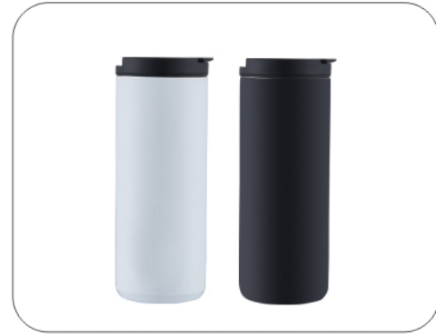
Model Capacity Packing LH-6607 500ml 24PCS/CTN