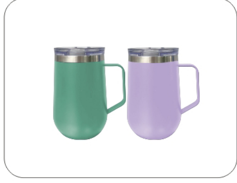
Model Capacity Packing LH-6213B 590ml 24PCS/CTN