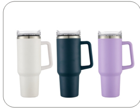
Model Capacity Packing LH-6217 1200ml 24PCS/CTN