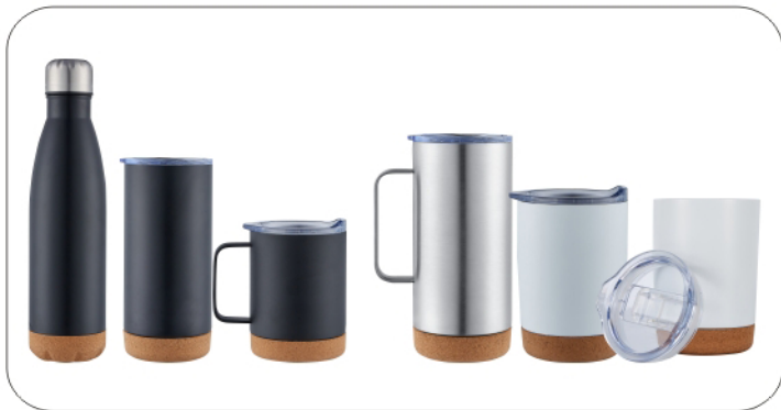
Model LH-6701 LH-6702 LH-6703 LH-6704 LH-6705 Capacity 500ml 520ml 380ml 480ml 350ml