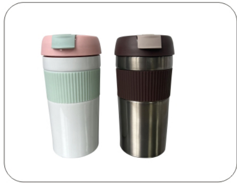
Model Capacity Packing LH-6618 500ml 24PCS/CTN