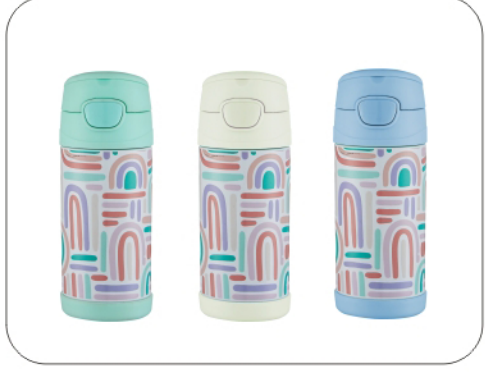
Model Capacity Packing LH-6151 350ml 24PCS/CTN