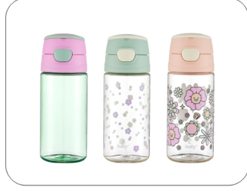
Model Capacity Packing LH-SL-5 460ml 24PCS/CTN