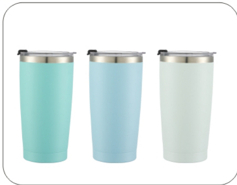
Model Capacity Packing LH-6130 590ml 24PCS/CTN