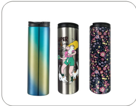
Model Capacity Packing LH-6211 500ml 24PCS/CTN