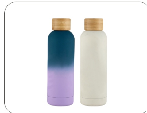
Model Capacity Packing LH-6608 500ml 24PCS/CTN