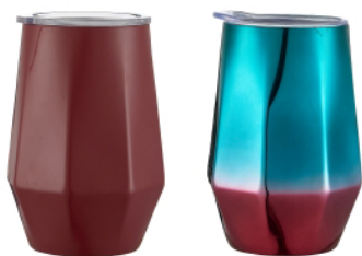
Model Capacity Packing LH-6603 350ml 24PCS/CTN