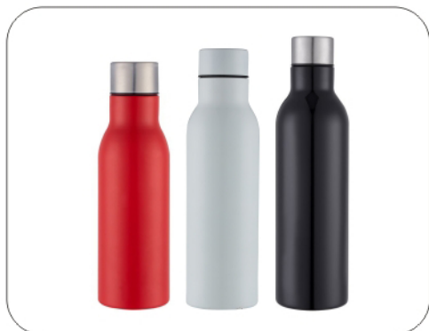
Model Capacity Packing LH-6002 350ml/500ml/750ml 24PCS/CTN