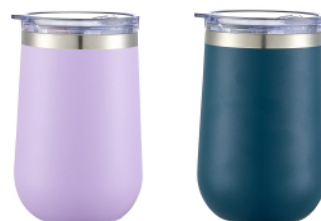
Model Capacity Packing LH-6213 590ml 24PCS/CTN