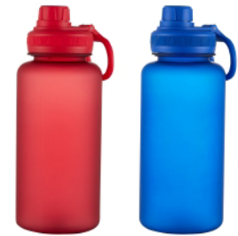
Model Capacity Packing LH-SL-3 1000ml 24PCS/CTN