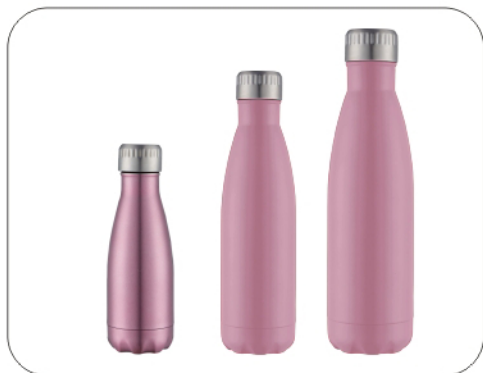
Model Capacity Packing LH-6008 350/500/750/1000ml 24PCS/CTN