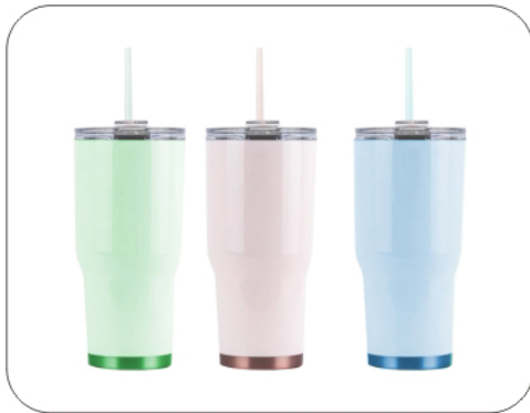
Model Capacity Packing LH-6612 590ml 24PCS/CTN