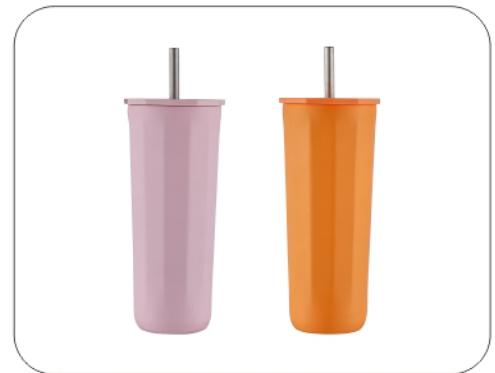
Model Capacity Packing LH-6106 500ml 24PCS/CTN