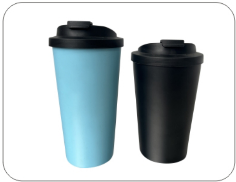
Model Capacity Packing LH-6617 350ml/500ml 24PCS/CTN