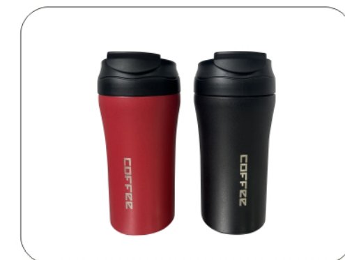
Model Capacity Packing LH-6616 500ml 24PCS/CTN