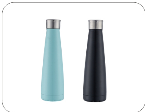
Model Capacity Packing LH-6129 450ml 24PCS/CTN