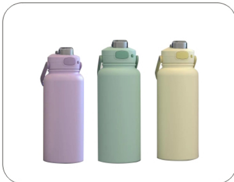
Model Capacity Packing LH-6093 1000ml 24PCS/CTN