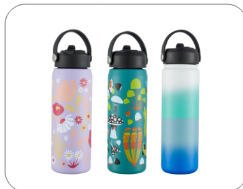
Model Capacity Packing LH-6172 950ml 24PCS/CTN