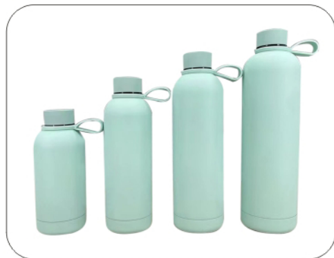
Model Capacity Packing LH-6610 350/500/750/1000ml 24PCS/CTN