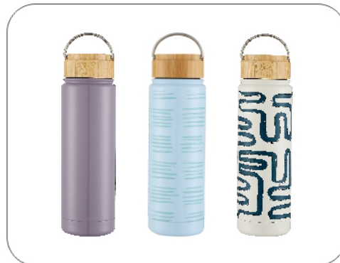
Model Capacity Packing LH-6001 600ml 24PCS/CTN