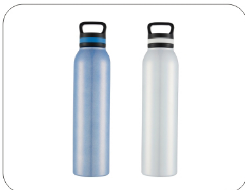
Model Capacity Packing LH-6017 800ml 24PCS/CTN