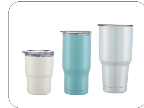
Model Capacity Packing LH-6165 420ml/700ml/880ml 24PCS/CTN