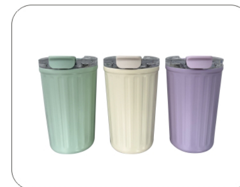
Model Capacity Packing LH-6615 450ml 24PCS/CTN