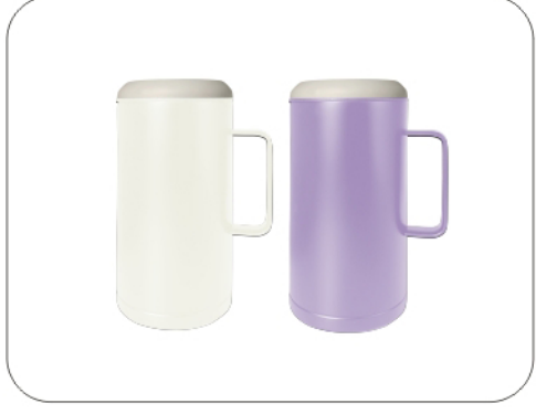
Model Capacity Packing LH-6164 1200ml 24PCS/CTN