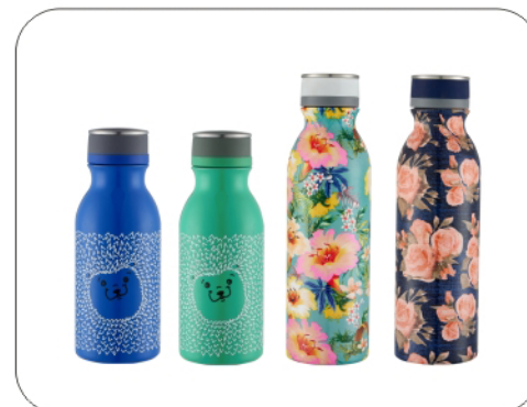
Model Capacity Packing LH-6136 350ml/500ml 24PCS/CTN