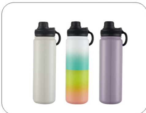
Model Capacity Packing LH-6065 700ml 24PCS/CTN