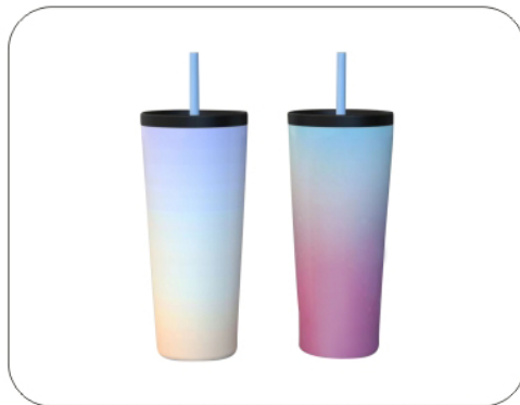
Model Capacity Packing LH-6613 590ml 24PCS/CTN