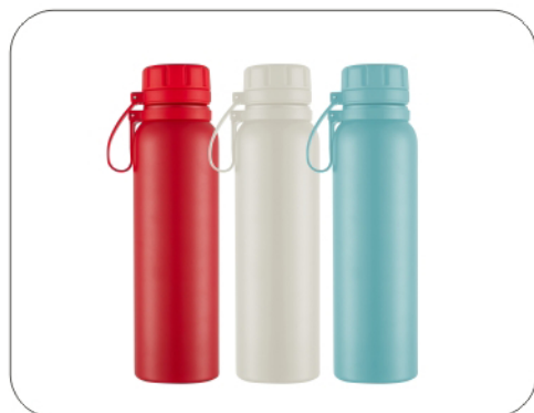
Model Capacity Packing LH-6174 850ml 24PCS/CTN