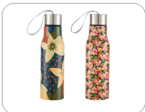
Model Capacity Packing LH-6173 500ml 24PCS/CTN