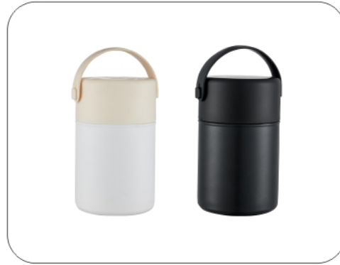
Model Capacity Packing LH-6606 800ml 24PCS/CTN