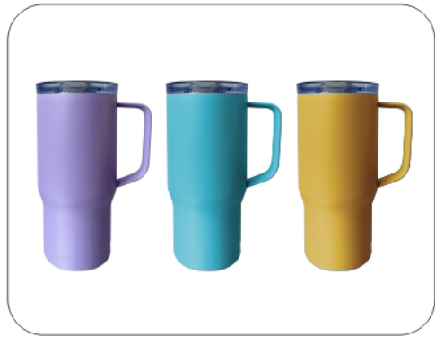
Model Capacity Packing LH-6165B 700ml 24PCS/CTN