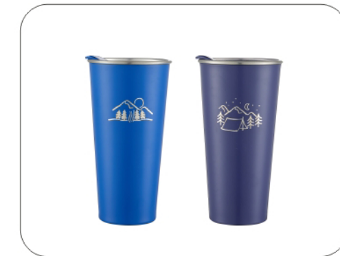
Model Capacity Packing LH-6070 500ml 24PCS/CTN