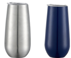
Model Capacity Packing LH-6602 170ml 24PCS/CTN