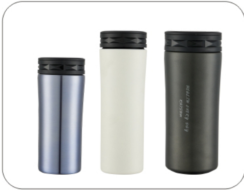
Model Capacity Packing LH-6052 350ml/500ml 24PCS/CTN