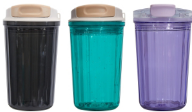
Model Capacity Packing LH-SL-6 450ml 24PCS/CTN