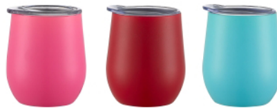
Model Capacity Packing LH-6601 290ml 24PCS/CTN